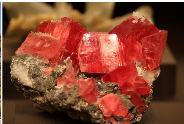
Terra Mineralia, one of the largest mineral collections in the world, Freiberg (Ore Mountains)

If you have time to venture deeper into Saxony or even visit our European neighbors, the websites of Upper Lusatia Tourism , Ore Mountains Tourism , Visit Czechia and Poland Travel can provide more inspirations.