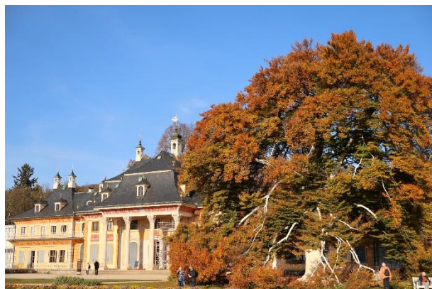
Pillnitz Castle, Dresden

For international visitors who would like to explore Dresden and Saxony beyond the conference, we recommend that you have a look at the websites of Dresden Tourism and Visit Saxony . From the world-famous Semper Opera and the Zwinger Palace in Dresden’s Old Town to the lively neighborhoods of Dresden Neustadt (“new town”), and from the sandstone mountains of Saxon Switzerland to the vineyards along the Elbe River, from historical steam trains to the European Capital of Culture in Chemnitz, there is a lot to explore in and around Dresden.